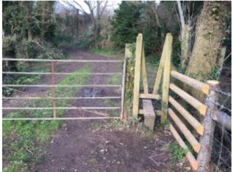
AWKWARD TO GET OVER AND SOMETIMES THE GATE IS LOCKED